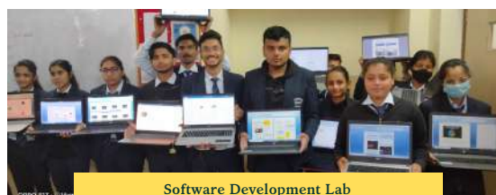
Software Development Lab