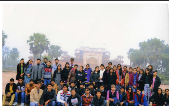
Educational trip to AGRA for B.Sc. (PCM) students