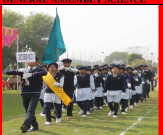
MARCH PAST BY STUDENTS ON 26-JAN-2015