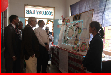
HIV VIRUS (ZOOLOGY DEPARTMENT)