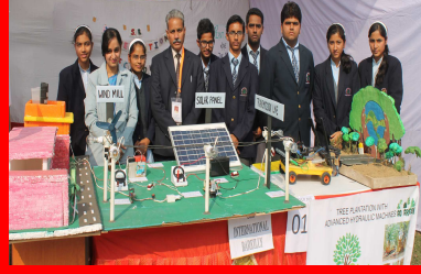
INTERMEDIATE SCHOOLS PARTICIPATING IN EXHIBITION