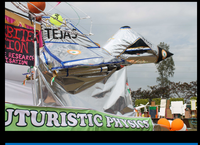
PEGEANT ON TEJAS AND MARS MISSION BY PCM STUDENTS