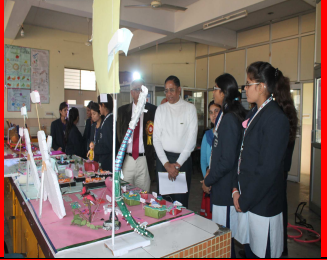
EBOLA (BIOTECHNOLOGY DEPARTMENT)