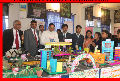
SMART CITY (BOTANY DEPARTMENT)