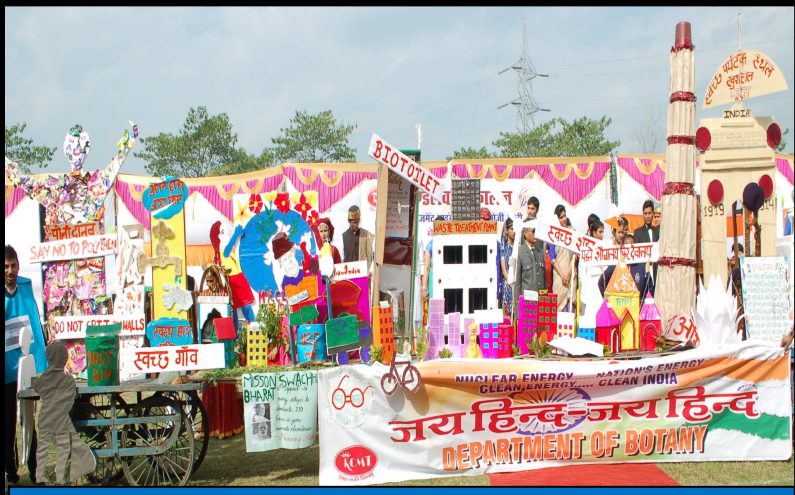
PEGEANT ON SWACHH BHARAT MISSION BY ZBC STUDENTS