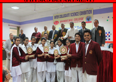
(WINNERS OF INTERCOLLEGIATE PARTICIPANTS)