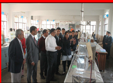
UREA PLANT (CHEMISTRY DEPARTMENT)