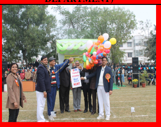
INAUGURATION OF ANNUAL SPORTS MEET