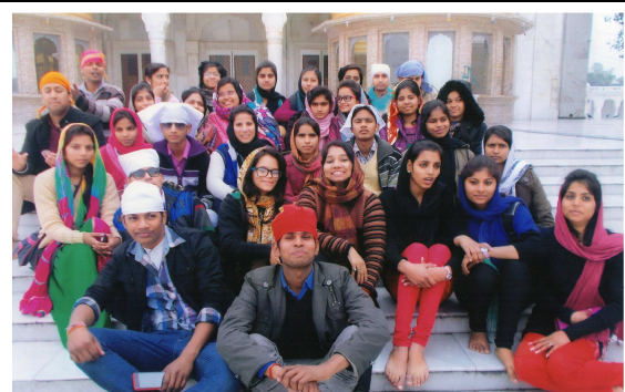
Excursion trip to NANAK MATHA for ZBC students